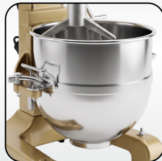
HYGIENIC STAINLESS STEEL CONTACT PARTS

Equipped with multiple speed settings, allowing users to handle different textures