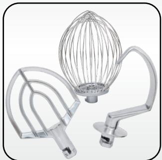
VERSATILE MIXING FOR MULTIPLE APPLICATIONS

Suitable for dough, cream, batter, egg, and stuffing