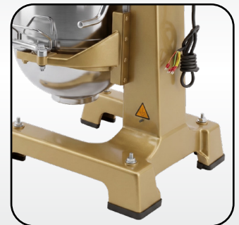
STABLE & HEAVY-DUTY CONSTRUCTION

All food-contact components are made of stainless steel, ensuring easy cleaning and compliance with food hygiene standards.