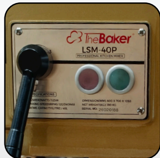
MULTI-SPEED CONTROL FOR PERFECT RESULTS

Suitable for dough, cream, batter, egg, and stuffing